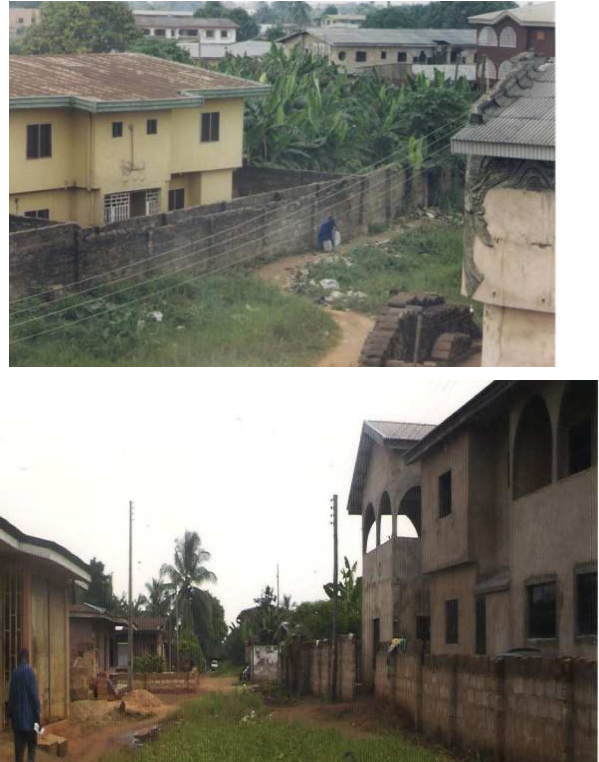
Figure 2. Typical housing development (predominantly of sandcrete blocks) in a semi-urban area in Nigeria [2]

The following companies manufacture cement in Nigeria: