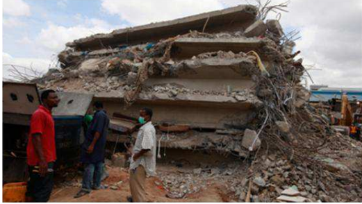
Figure 1. Collapsed Synagogue building in Nigeria [5].

buildings that had outlived their life spans, some were still undergoing construction, some had been declared unsafe and undergoing demolition while others were already completed and in use when the sudden collapse occurred. Figures 1 and 2 show some of the collapsed buildings in Nigeria.