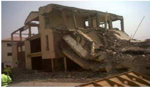
Figure 2. Collapsed Naval building in Gwarinpa, Abuja, Nigeria [4].